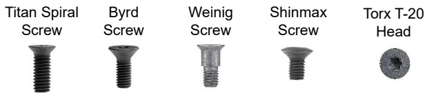
Not shown to scale.

* Non-Shear Type See page 36 for Reference Engravers.