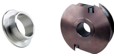
T-Bushing to 1-1/4" ID to run on your shaper for end matching.

Heads require steel backing plates that are ground to your pattern and used to support solid carbide knives. They are a one time purchase per pattern. Custom Pattern Inserts made for the same price.