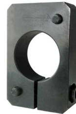
Safety Lock Collars