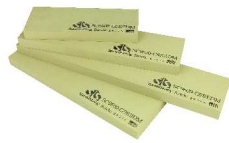
SpeedStone (USA Option)

Vitrified Stones: Cooler Honing. More Aggressive.