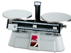
O'Haus Harvard 1450-SD

We offer close tolerance digital weight scales, trip, & triple beam balancers for cross balancing knives and head parts to within 0.1 grams. Scales are helpful in eliminating joint or material finishing problems created from improper balancing. Save your machine spindle bearings by balancing your knives. Standard scales for balancing knives, gibs, bolts & screws, and other critical components.