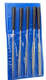
Diamond Electroplated 5 Piece Needle Set for Fine Details FD-69989 $25.00