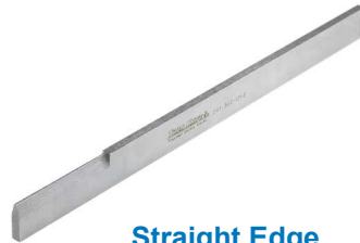
Straight Edge for Moulder Heads / Pressure Shoes #A-PT-SE $37.80