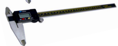
6" Mitutoyo Calipers (Pro-Quality), AP1-MIT $116.00 ea.