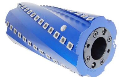
Spiral Heads with Keyways