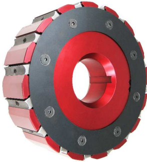
Quick-Lock Terminus™ Style & Tersa™ Style Planing Heads of Any Size