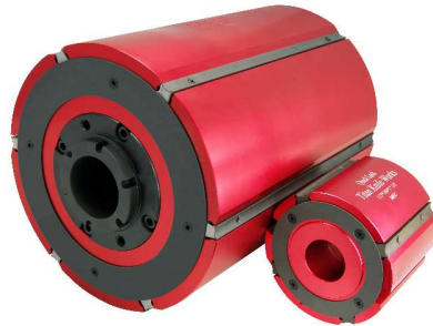
Large Planer Knife Heads with Centering Sleeve