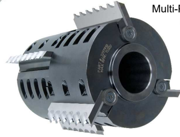
Stackable HD Multi-Profile Insert Heads