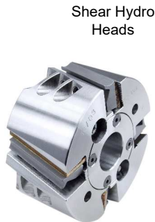
Shear Hydro Heads