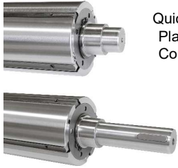
Quick Change Planer Head Conversions